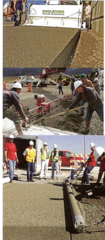
Contractors can install pervious concrete using (top to bottom) a slipform paver, model by Evolution Paving Resources; a truss screed, model by Allen Engineering; or a power roller screed, model by Bunyan Industries. All three screed types are acceptable for use with pervious concrete.

But the concrete industry is working to prevent these failures and provide correct specs. ACI 522 Pervious Specification was created as