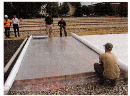
Cross rolling pervious concrete can be done before or after plastic sheeting is placed to help the curing process. Equipment shown here includes Lura Enterprises' Lightning Strike Roller Screed and the company's cross roller.

Pervious concrete's presence in the concrete industry is going to continue to grow. Factors such as the Green Building movement, the Clean Water Act, and the rising price and changes