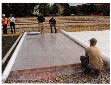
Cross rolling pervious concrete can be done before or after plastic sheeting is placed to help the curing process. Equipment shown here includes Lura Enterprises' Lightening Strike Roller Screed and the company's cross roller.

Pervious concrete's presence in the concrete industry is going to continue to grow. Factors such as the Green Building movement, the Clean Water Act, and the rising price and changes